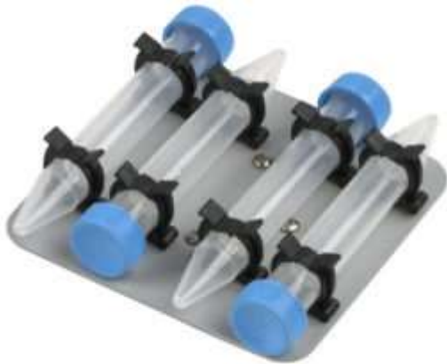
Vortex Adapter For 4 X 15ML Tubes