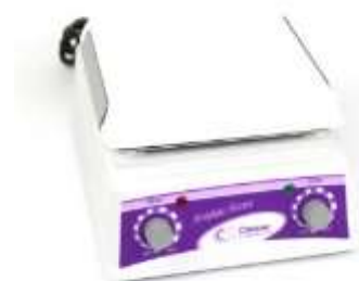
Hotplate Magnetic Stirrer