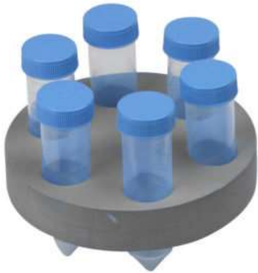
Vortex Adapter For 6 X 50ML Tubes